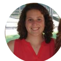
Reagan Portelance Lecture Series