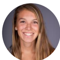
Amanda Beach Encounter