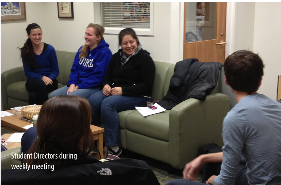
Student Directors during weekly meeting