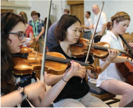
DCC violinists and cellist warm up to play at 11 am Mass in Goodson Chapel.