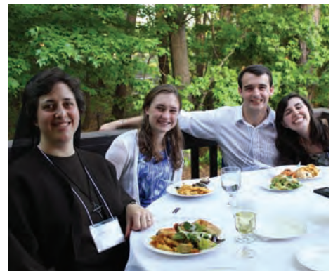
Duke Catholic leaders enjoy dinner with the sisters after the blessing at the Sisters' Convent.