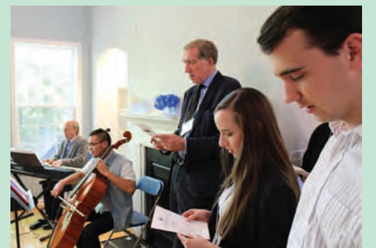
DCC Staff, Advisory Board, and students sing a psalm during the blessing of the Sisters’ Convent.

Thanks to all the donors that have made this huge blessing possible!