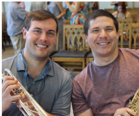
Duke Alumni gather before morning Mass in Goodson Chapel.