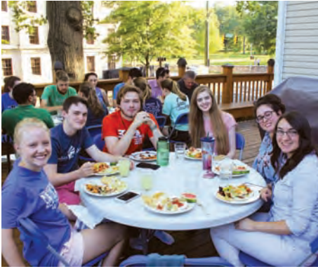
Students during a summer Tuesday Night Dinner.