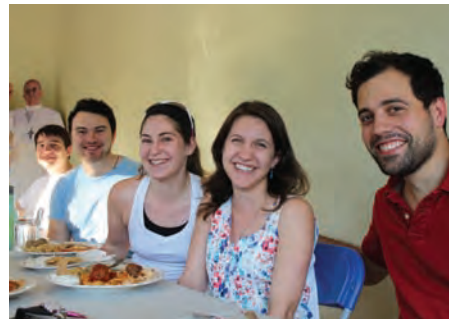
Graduate Students during Tuesday Night Dinner.