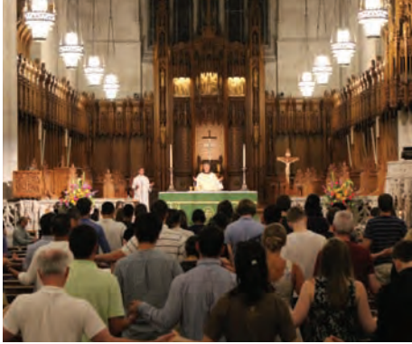
9 pm Duke Catholic Mass in Duke Chapel.