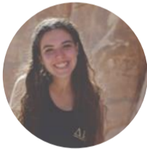
Luisa Frasson-Nori Lecture Series